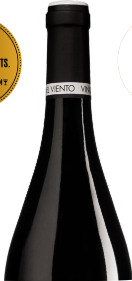
VINOS DEL VIENTO